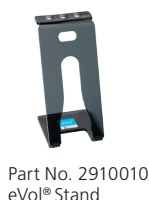
Part No. 2910010 eVol® Stand