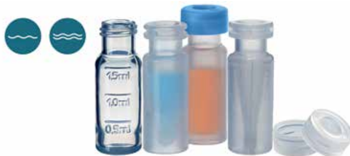
SureSTART vials and caps shown below are in 100 pack, but are also available in 5,000 and 10,000 pack options.

To assure no contamination or background corruption for PFAS analysis, we have more than one recommended closure. You are able to use one piece polypropylene snap ring caps or polypropylene 9 mm screw thread caps with a thinned penetration area. When resealing for multiple injections is important, we offer snap ring and screw thread caps with a silicone/polyimide septum for trouble free analysis.