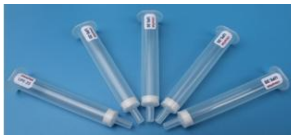
Figure(A). Typical Photo for UPE-20 cartridges

The Ultra-high Performance Extraction (UPE) cartridges are a novel type of solid phase extraction (SPE) cartridges manufactured by ChiralTek. The UPE particles were prepared through a specially-designed procedure by bonding C18 (ODS) and ChiralTek proprietary functional groups onto high-quality porous spherical silica particles. By using a ChiralTek proprietary packing approach, the UPE particles were then packed into kinds of polypropylene tubes with different sizes to manufacture several models of UPE cartridges for ultra-high performance solid phase extractions. The following Figure (A) shows a typical photo of model UPE-20 cartridges.