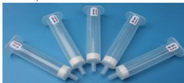
Figure(B). Typical Photo for UPE-90 cartridges

The UPE-20 model cartridges (specification: 20 mg/3mL, 120Å, 50 PCs/pkg) in Figure (A) are suitable for extraction of small volume samples (0.5 – 200mL). The sample capacity of the UPE-20 cartridges are equivalent to other supplier's 100-200mg/3mL ODS (C18) type of conventional SPE cartridges. Similarly, another model UPE-90 cartridges (specification: 90 mg/6mL, 120Å, 25 PCs/pkg) in Figure (B) are suitable for extraction of large volume samples (500 – 2000mL).