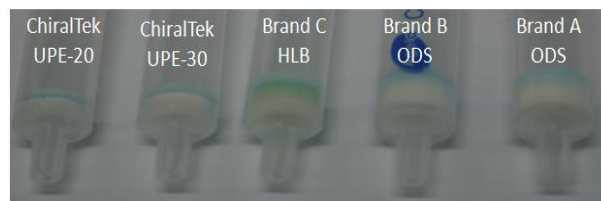
Figure(D). Comparison of column bed colour of different cartridges after loading same amount of Methyl Blue samples.

The ChiralTek UPE cartridges also exhibited much better recovery when compared to conventional SPE cartridges from other manufacturers. The following experiment was illustrated by the example of extraction of 1 ppm Methylene Blue in 3 mL water matrix. After being conditioned by methanol following by loading same volume of 3 mL of 1-ppm Methylene Blue solution, the color of the column beds of ChiralTek UPE, Brand A, B, C cartridges (3mL SPE cartridges) is shown in Figure (D).