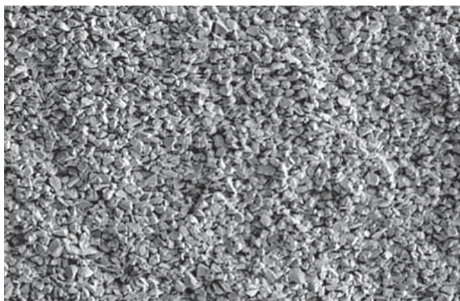
High Density (HD) Empore™ Membrane (10-12 µm particle size)